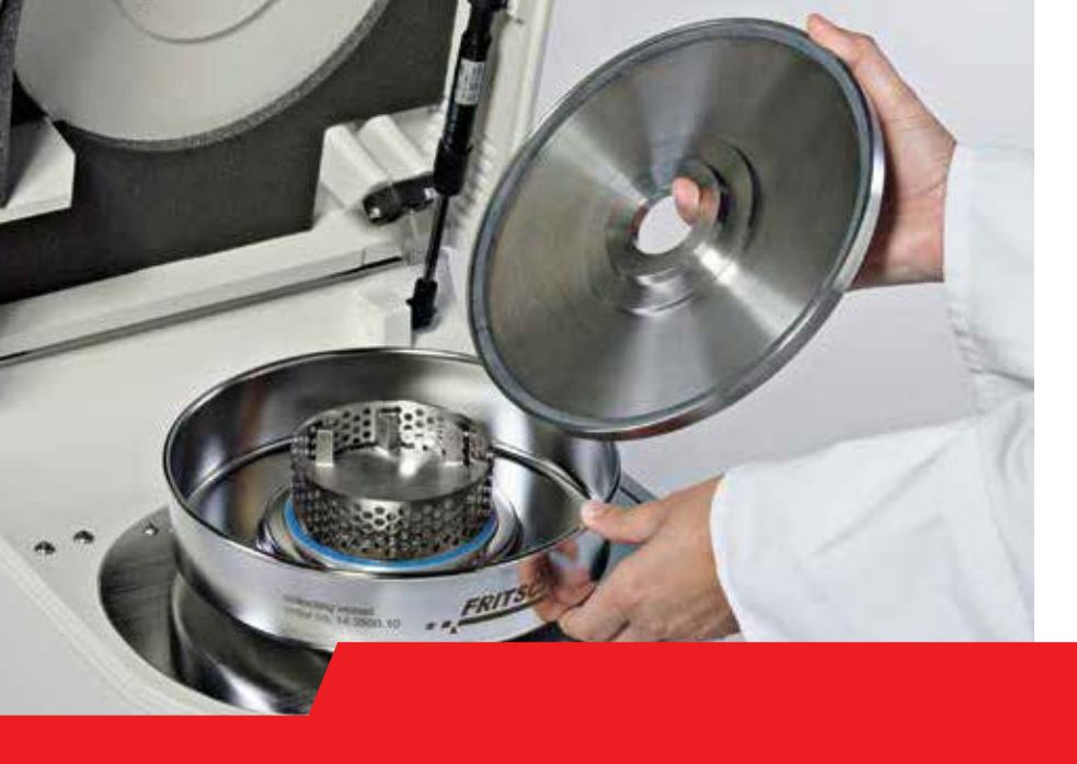
Fig. 1: Inside of PULVERISETTE 14 rotor mill, showing fixed collection pan, rotor, and sieve ring. High performance Cyclone sample collector in stainless steel is shown on the left. Used together with modified collection pan, the P14 system and Cyclone allow continuous feeding and homogenization of flowers or CBD isolate into the low micron range (consistency of talcum powder).