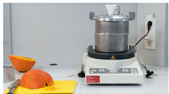
Fig. 1: Pre-cut pumpkin & PULVERISETTE 0 with cryo-box