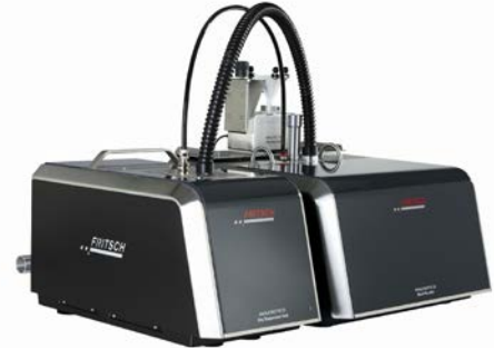
ANALYSETTE 22 MicroTec plus with dry dispersion unit

The sieve analysis is due to good reason no ICC- standard method, because it can not be standardized. Especially since the moisture fluctuations of the sievings cause a substantial degree of errors, equally to the different flow characteristics. The quality of the sievings depend on it and never achieve 100 %, here an endless long sieving period would be required, especially if several sieves are below one another. Two steps are carried out in trying to improve the reproducibility of a sieve analysis of flour. First, with only one sieve the finest material for example below 90 µm is sieved off and in a second step, the now better flowing throughput is sieved with the remaining sieve set. A better reproducibility is achieved with the new Laser Particle Sizer, which can be universally used to determine the particle size distribution of all intermediate and final milling products. It is suitable for the use in quality control and process control. Through the flexible programmability of the entire dispersion and measuring process it is very well suitable in the areas of research and development.